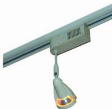
E-11 石英轨道灯 (白)